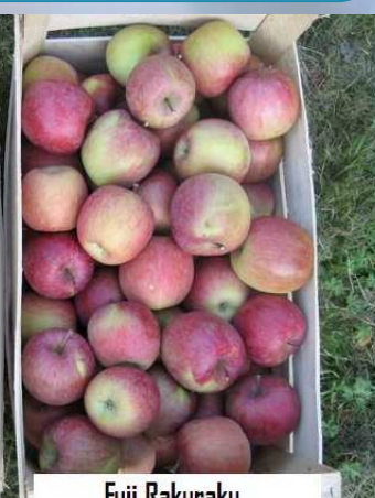
Non contractual information and photos