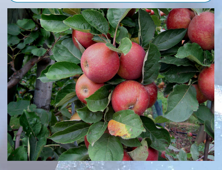
Non contractual information and photos