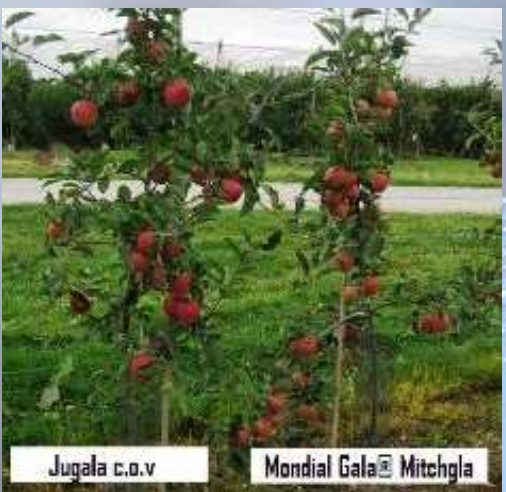
Non contractual information and photos