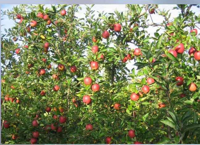
Non contractual information and photos