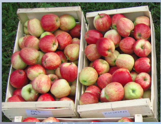
Non contractual information and photos

- Susceptibility to alternate bearing: low