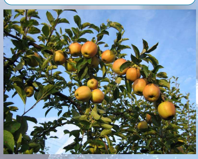
Non contractual information and photos