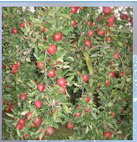
Non contractual information and photos