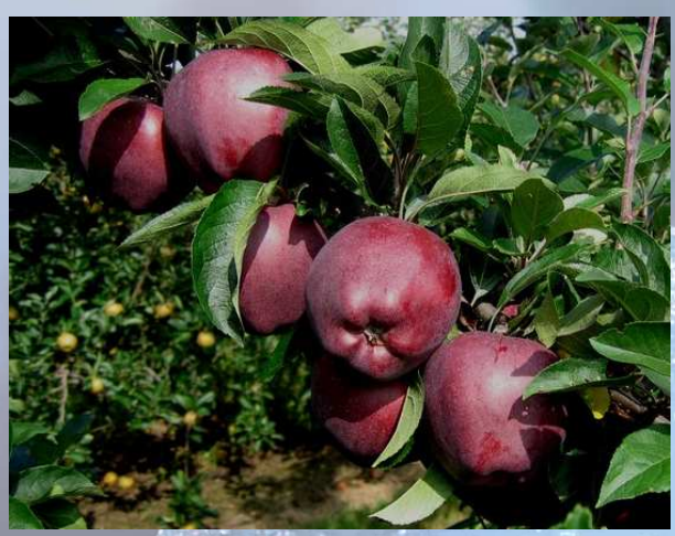
Non contractual information and photos