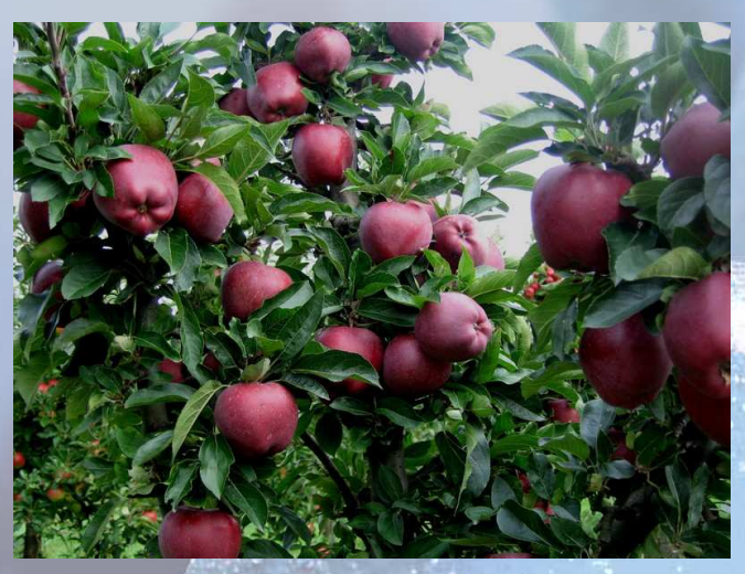
Non contractual information and photos